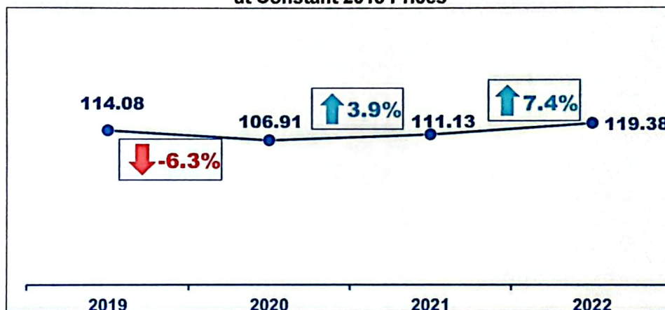
Figure 1. Gross Domestic Product of Misamis Occidental, 2020 to 2022 Levels (in Billion PhP) and Growth Rates (in Percent) at Constant 2018 Prices

The economy of Misamis Occidental posted an accelerated growth of 7.4 percent in 2022, faster than the 3.9 percent growth in the previous year. This economic growth translates to a value of the province's Gross Domestic Product (GDP) of PhP 119.38 billion. Such GDP value exceeded the pre-pandemic GDP level of PhP 114.08 billion, indicating economic recovery of the province from the negative impact brought about by the pandemic. (Figure 1)