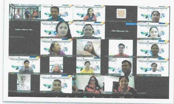
Photo opportunity during the conduct of the virtual training of LGU on the adoption of PSIC and PSGC.

21 June 2024, Ozamiz City – A virtual training session was conducted for Local Government Units (LGUs) to facilitate the adoption of the Philippine Standard Industrial Classification (PSIC) and the Philippine Standard Geographic Code (PSGC) last June 13, 2024. The event, held via Zoom, aimed to equip LGUs with the knowledge and skills needed to implement these standards effectively.