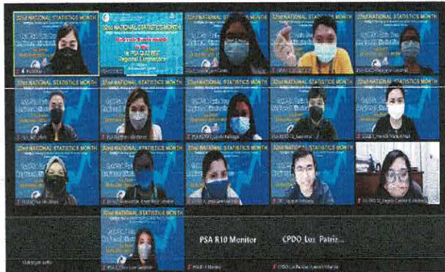
Representatives of the RSC member-agencies compete for the 1 st PSA Quiz Bee Regional Eliminations

Other RSC member-agencies which participated in the 1 st PSA Quiz Bee Regional Eliminations were DOLE, DPWH, DSWD, DTI, TESDA, and CPDO-Iligan City.