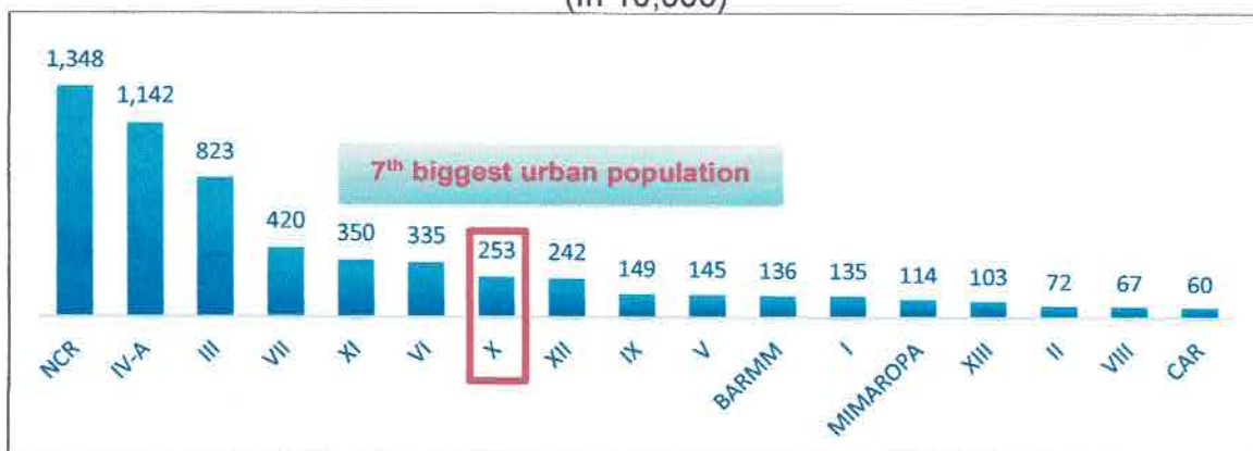
Figure 1. Urban Population by Region, Philippines: 2020 (In 10,000)