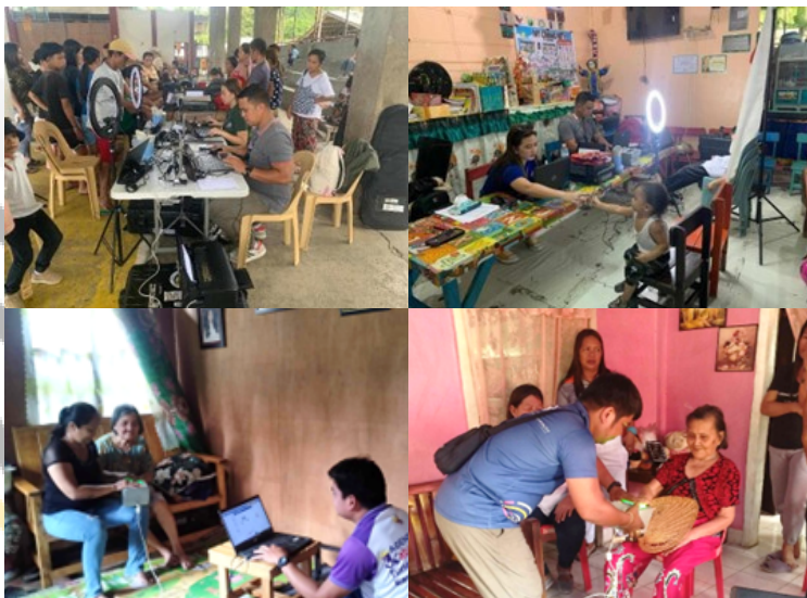
Left to right (clockwise): Registration of DSWD beneficiaries in Brgy. Dalipuga, Iligan City and Rehistro Bulilit at Hinaplanon Day Care Center; and house-to-house registration strategy for the elderly and persons with disabilities in Misamis Occidental

Our commitment to accessibility and efficiency was further demonstrated through various outreach activities, including information drives and registration booths set up at public events. These efforts led to a notable increase in registrations, reflecting the support and trust of local stakeholders and the public.