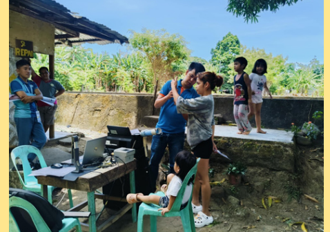
PSA Region X brings PhilSys registration services directly to communities through mobile registration teams—making National ID access easier and more inclusive for all.